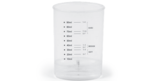
(D) MEASURING CUP